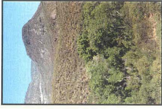
Proposed Trail Alignments

Three of the recommended segments extend outside the boundaries of the Phase One study area. These are the New River, Agua Fria River, and Central Arizona Project (CAP) corridors. The New River and Agua Fria River segments have already been studied by the Maricopa Association of Governments and the Flood Control District of Maricopa County. Since the ultimate goal of the Maricopa County Trail Commission is to connect all the regional parks, it is appropriate to include the entire corridors from the existing studies at this time. Identifying only a portion of the corridor seemed counter-productive. The same rationale applied to the Central Arizona Project Aqueduct. The CAP was included from Tribby Wash to the eastern boundary of Maricopa County. The canal cuts across the center of the study area and has the potential to become a major trail route across the entire County. A feasibility study sponsored by several jurisdictions to determine how to incorporate a shared use path along the canal will be completed in 2003.